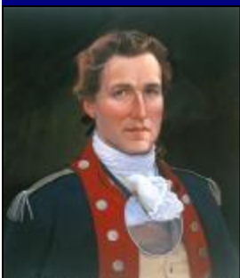
Gen. George Rogers Clark Founder of Louisville