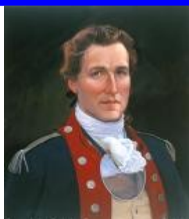
Gen. George Rogers Clark Founder of Louisville