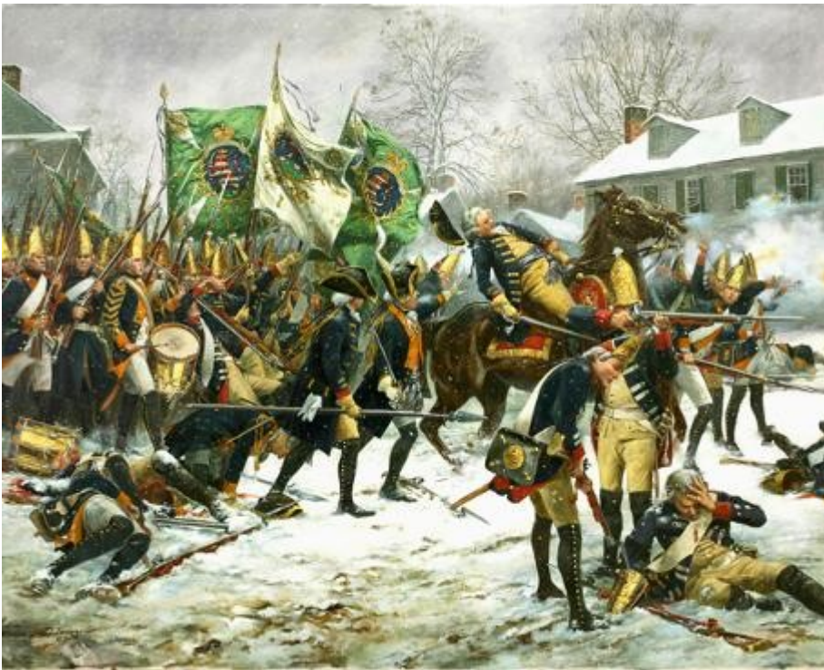
The Battle of Trenton - The Hessians by Don Troiani

Hessen-Kassel sent 19 regiments of troops to the American War, more than any other German principality. A regiment consisted of 21 officers under arms plus five non-combatant officers (chaplains, surgeons, etc.) 60 sergeants and corporals, 22 drummers, and 525 privates, or 633 individuals per regiment for a total on paper of 12, 027 individuals in 19 regiments. I say on paper, because the regiments were almost always undermanned, even though the Landgraf got his full stipend. The much smaller Hessen-Hanau sent 2,422 troops, of whom 981 did not return home. This figure may be misleading, as it included not only the dead, but also deserters to the Americans and those who stayed in Canada, where the regiments retreated before being shipped back to Europe.