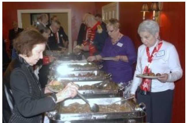
(Right) The buffet served at Owl Creek C.C. is always excellent!