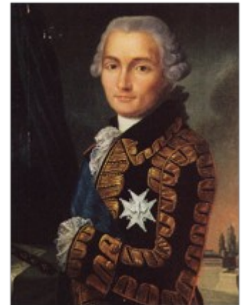
Comte de Rochambeau (1725-1807)